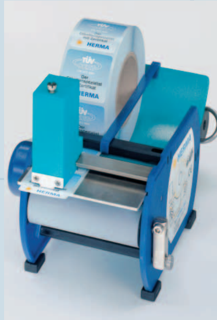
HERMA 100 Dispenser

A backing-paper rewriter ensures smooth operation of the HERMA 100 dispensers.